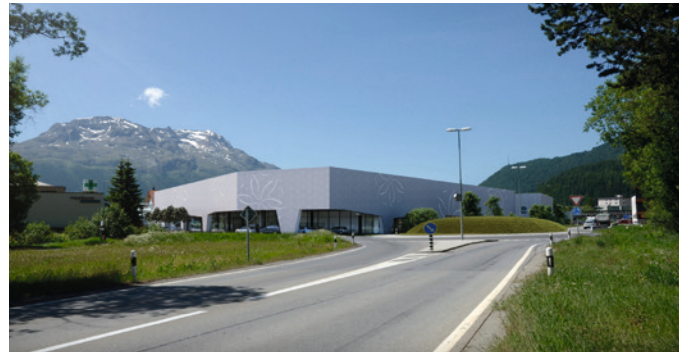
COOL-FIT 4.0 reduces the amount of energy required for heating and cooling.